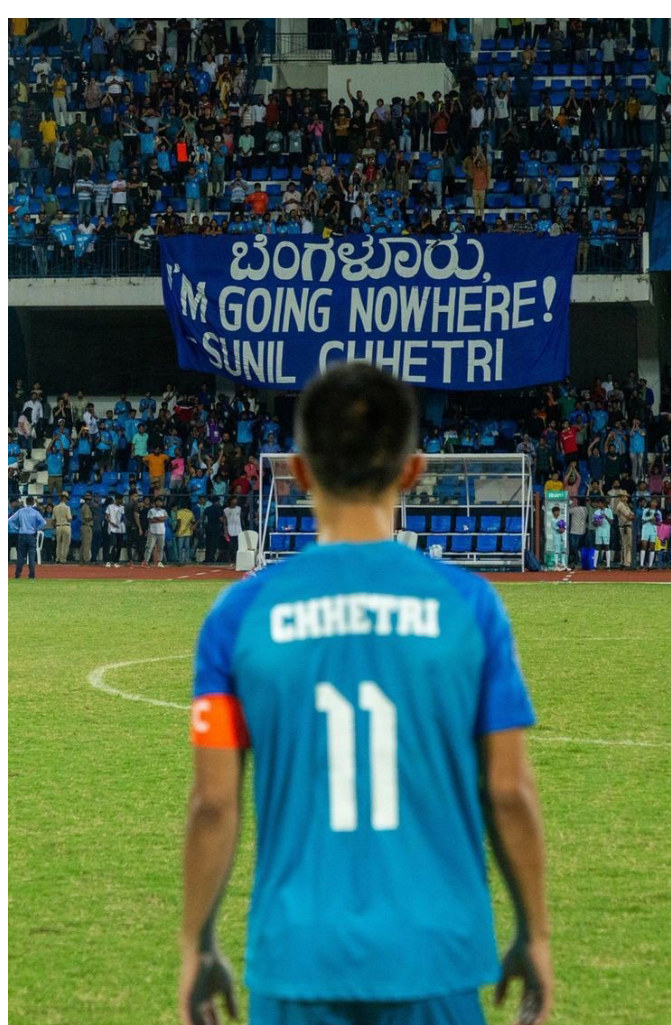
Sunil Chhetri announced on Thursday, announced that he will retire from international football after the FIFA World Cup qualification match against Kuwait on 6 June.

His role was not restricted to finding the back of the net anymore. Despite increasing expectations and the pressure