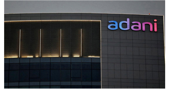
The acquisition will consolidate AESL's presence in central India with 4 operating assets having 3,373 ckt km in the region

Solutions has acquired 100 per cent stake in Essar Transco Ltd for Rs 1,900 crore.