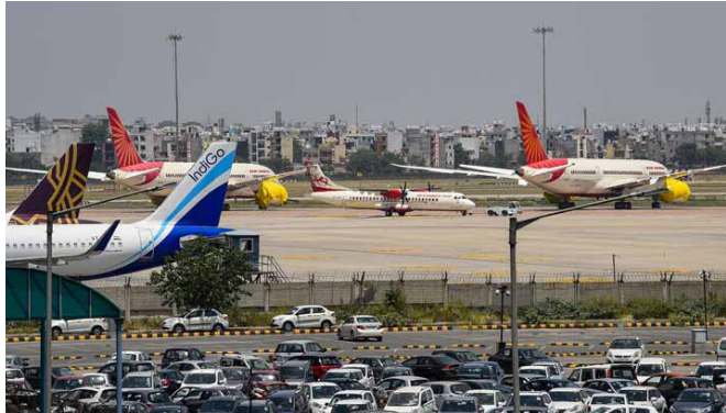
Indian airport operators' revenue is anticipated to grow 15-17 per cent on an annual basis

Indian airport operators' revenue is anticipated to grow 15-17 per cent on an annual basis in the current fiscal ending March 2025, it added.