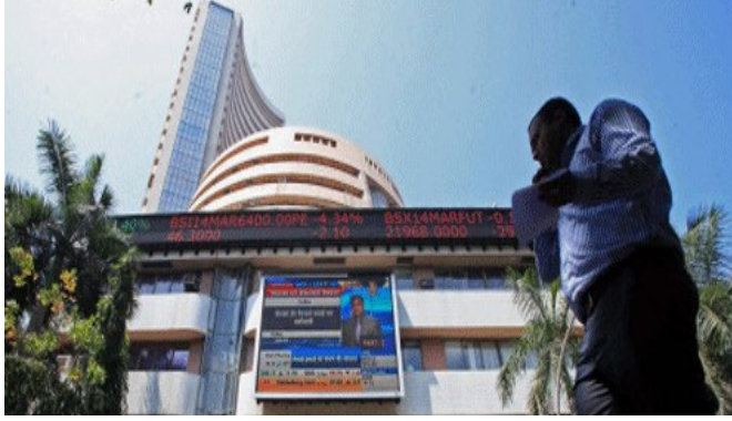
Among the Sensex components, Mahindra & Mahindra, Bharti Airtel, Tech Mahindra and JSW Steel were the major gainers

Among the Sensex components, Mahindra & Mahindra, Bharti Airtel, Tech Mahindra, Titan, Infosys, JSW Steel, Bajaj Finserv, HDFC Bank, Larsen & Toubro and Kotak