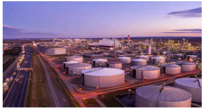
The new rates are effective from 16 May

Founded in 1904, Elkem ASA is a silicon-based material provider, and listed on the Oslo Stock Exchange. Reliance will continue to retain the technology and intellectual property rights pertaining to kerf-based polysilicon, the firm had stated in January. REC Norway had a turnover of Norwegian krone 1.1 billion in the calendar year 2022 and a net worth of Norwegian krone 0.3 billion as of 31 December, 2022, contributing about 0.08 per cent and 0.03 per cent, respectively, of Reliance's annual consolidated turnover and net worth for the financial year 2022-23, it had said. —PTI