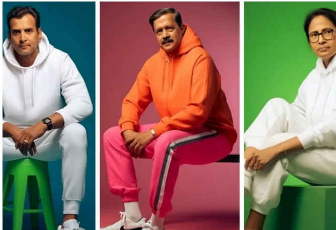
These images of Rahul Gandhi, Arvind Kejriwal and Mamata Banerjee were created using AI tools