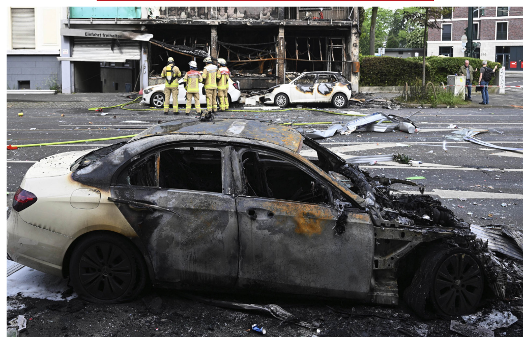
A burnt car stands in front of a residential building where firefighters inspect the damages after a fire raged in Duesseldorf, Germany.