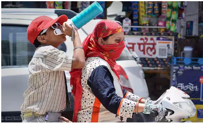
IMD has flagged 'health concern' for vulnerable people

The Met office had earlier predicted a higher-than-normal