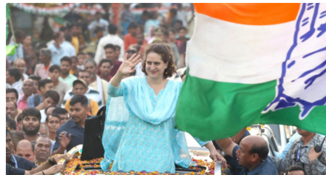
Congress General Secretary Priyanka Gandhi greets the gathering during a roadshow for the Lok Sabha Polls, in Rae Bareilly on Thursday

Congress leader Priyanka Gandhi Vadra on Thursday said her party follows the ideals of Mahatma Gandhi who uttered "Hey Ram" before dying and Prime Minister Narendra Modi was wrong in accusing it of being anti-religious. "They accuse us of being against the Hindu religion. We follow Mahatma Gandhi's ideal who had chanted 'Hey Ram' before dying," she said, addressing a poll rally at 'Chaudh Mill roundabout,' about 20 km from the district headquarters. She alleged that while the saffron party claims to be a "champion of Hindu religion," the condition of the state-run cowsheds in Uttar Pradesh remains pitiable. "They accuse us of being against religion for turning down invitations for the consecration ceremony in Ayodhya. Just look at the condition of the cowsheds in UP where a video showed dogs eating flesh of a dead cow," she said. She said that during Congress rule in Chhattisgarh,