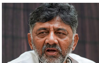
DK Shivakumar

Central government failed to implement its promises of Central Food Security Act to