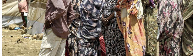
Sudan plunged into conflict in mid-April 2023

and elsewhere in Sudan if they don't allow humanitarian aid into the vast western region - a view echoed Wednesday by Nkweta-Salami.