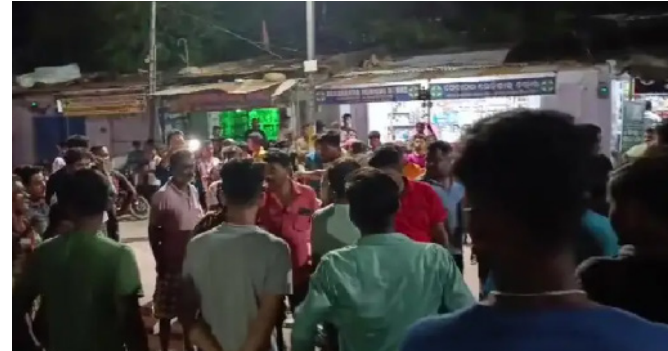
Odisha murder took place over putting up posters