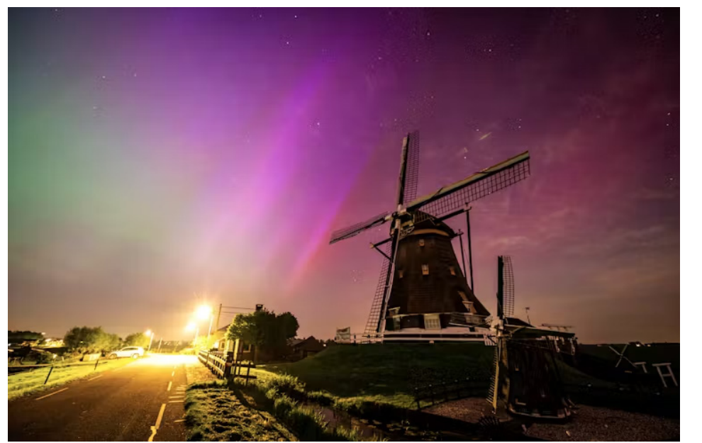
The storm caused auroral activity in locations where it doesn't often take place