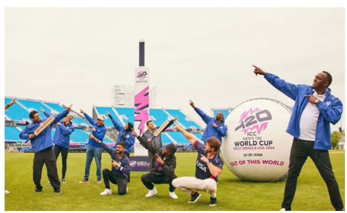
Usain Bolt is the brand ambassador of the upcoming ICC T20 World Cup 2024.

"I grew up on cricket. My dad was a massive cricket fan and still is. It is something that I have always in my blood. It is wonderful to be a part of cricket again as an ambassador. I never got to live my dream of being a cricketer so to be ambassador of T20 World Cup is wonderful," Bolt told PTI in a telephonic interview from New York on Wednesday night.