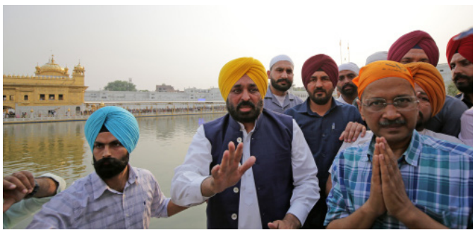
Delhi Chief Minister Arvind Kejriwal and Punjab CM Bhagwant Mann visit the Golden Temple to pay obeisance, in Amritsar on Thursday