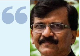
-Sharad Pawar, NCP (SP) Chief

Never ever has such an incident happened where roads were shut for Prime Minister Narendra Modi's campaign and causing inconvenience to people. It is inhuman to hold a roadshow where people died after the hoarding collapse.