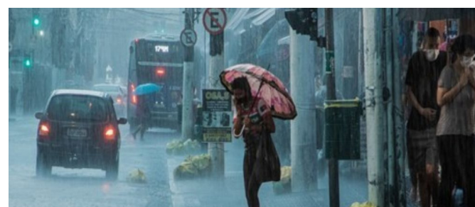
South Karnataka is expected to receive rainfall between 115.5mm to 204.5mm rain