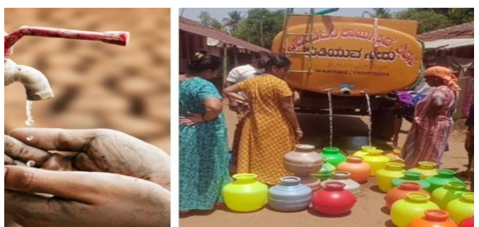
224 out of the 241 clean drinking water units constructed by Zilla Panchayat shut down

More than 120 borewells and 80 public wells have gone dry in the hilly areas. Despite