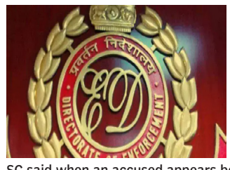
SC said when an accused appears before a court, the agency will have to apply to the court concerned to get his custody

The twin conditions state that when an accused in a money laundering case applies