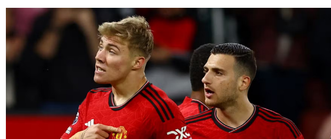
Manchester United celebrates scoring his team's second goal.

Kobbie Mainoo opened the scoring for Manchester United in the 31st minute, taking advantage of a lapse in Newcastle's defense. Newcastle responded in the second half, equalizing through Anthony Gordon. However, Manchester United regained the lead when Amad