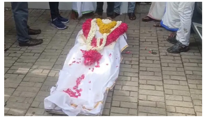
Relatives of the woman who could not meet her husband before his death in Oman due to AI Express strike protest with his body outside Air India SATS office in Thiruvananthapuram

The Mizoram government, civil society organisations and student bodies have strongly opposed the Centre's decision to fence the India-Myanmar border and lift the FMR because they believe that it will "disturb" close contact between ethnic communities of the two countries. —PTI