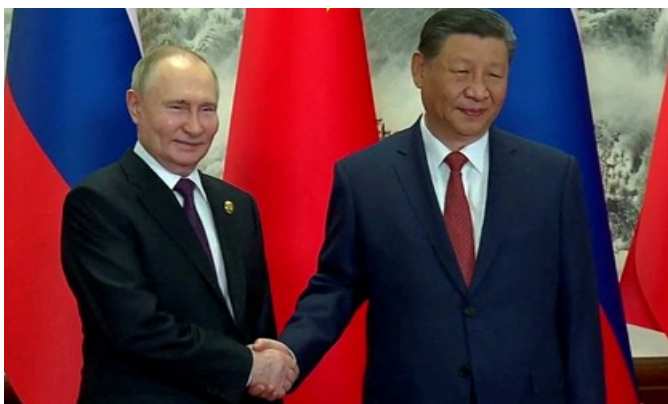
Russian President Vladimir Putin and Chinese President Xi Jinping attend a signing ceremony in Beijing, China

"China is ready to work with Russia to stay each other's good neighbour, a good friend and good partner that trust each other, continue to consolidate the lasting friendship between the two peoples.