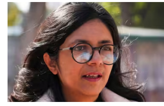
Swati Maliwal

Delhi Police also recorded her statement. Her statement was recorded by a two-member team of the Delhi Police at her residence in Central Delhi. According to a police officer,