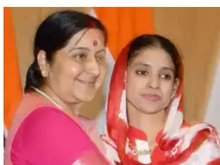
Late Minister of External Affairs Minister Sushma Swaraj helped Geeta reunite with her family

The Class 8 examination conducted by the State Open School Education Board will begin on 21 May and conclude