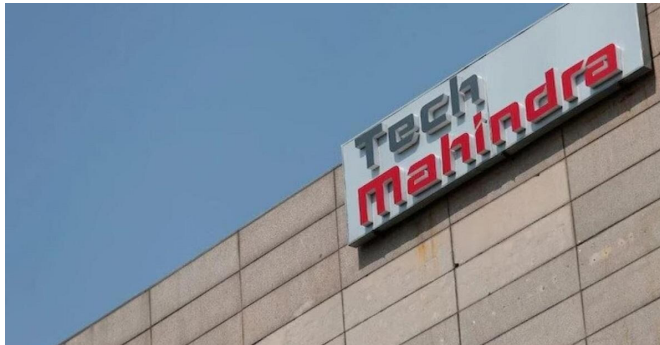
Revenue increased to Rs 35,452 crore in the fourth quarter

"It has been an excellent year with most of our busi-