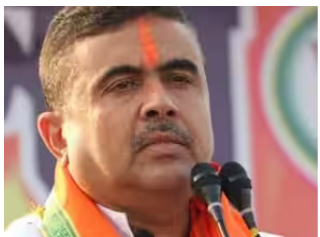
Suwendu Adhikari; Mamata Banerjee

As the electoral battle intensifies in West Bengal's Tamluk constituency, a fierce confrontation between TMC and BJP looms large with TMC seeking retribution for Mamata Banerjee's loss in Nandigram and the saffron party striving to fortify its stronghold. Former Calcutta High Court judge Abhijit Gangopadhyay, who joined BJP immediately after resigning from his post on 5 March and was fielded by the party from the crucial seat, and the selection of young Turks Debangshu Bhattacharya and Sayan Banerjee by TMC and CPI(M) respectively have intensified the political rivalry in the seat. Nandigram, where the anti-