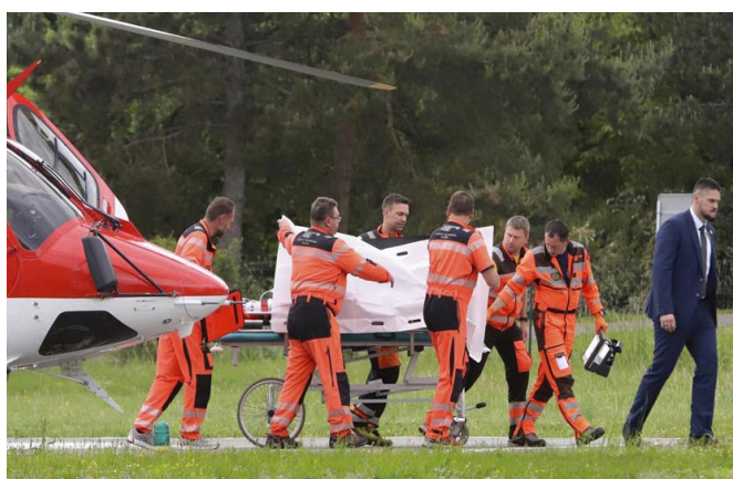
Rescue workers wheel Slovak Prime Minister Robert Fico, who was shot and injured, to a hospital in the town of Banska Bystrica, central Slovakia