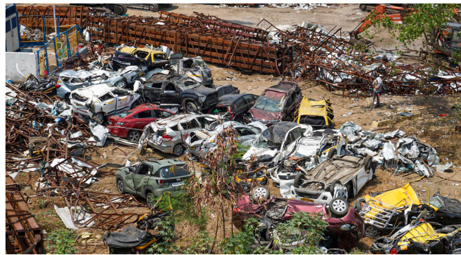
Wreckage of the vehicles that were damaged after a 100-foot-tall illegal billboard fell on a petrol pump on Monday

Rains in Kerala are likely to intensify in the next few days as the India Meteorological Department on Thursday issued an orange alert in several districts of the state from 18 May to 20 May. The India Meteorological Department (IMD) issued an orange alert for Palakkad and Malappuram for 18 May, Pathanamthitta, Alappuzha and Idukki for 19 May and in seven districts of the state for 20 May. In a respite from sweltering heat, Chennai and nearby districts on Thursday received light to moderate rainfall and several other regions of Tamil Nadu too witnessed showers. —PTI