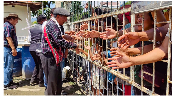
Indians shake hands with Myanmar nationals during a rally against scrapping of the Free Movement Regime at Indo-Myanmar Friendship Gate, in Champhai district of Mizoram, on Thursday